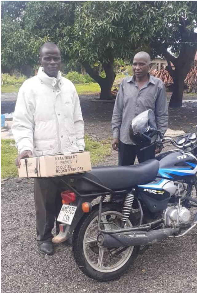
Taking a box of NTs to a village by motorbike