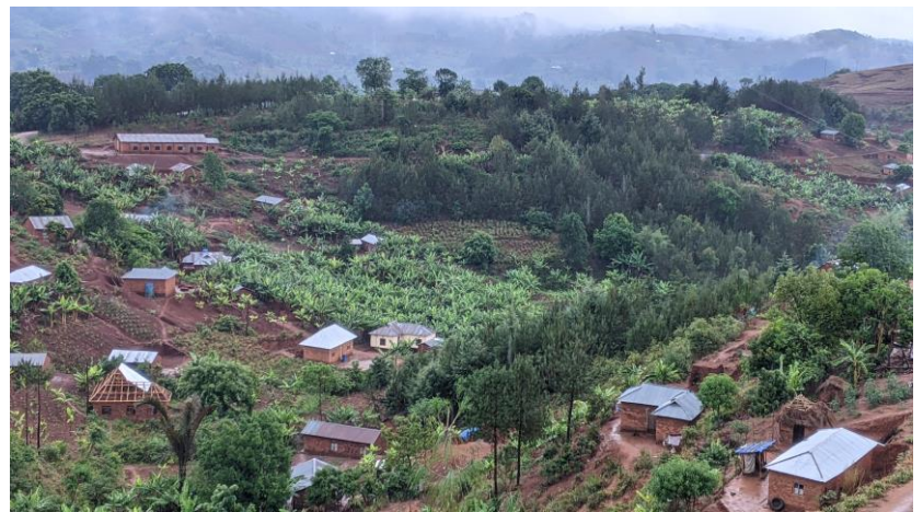
Typical Ndali Village