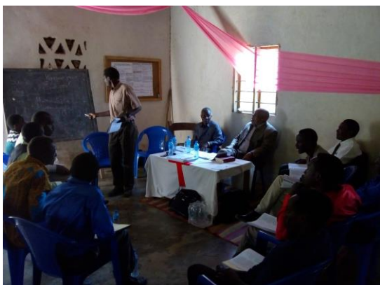
A local Scripture-checking session