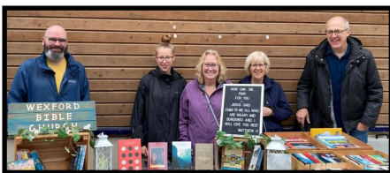
Wexford Bible church stand, Ireland

Summer: We both took part in a one-week OM outreach to Ireland with a group from our church here in Niagara. It was a wonderful time of fellowship and working together, whilst opening up people's understanding to mission needs in Europe.